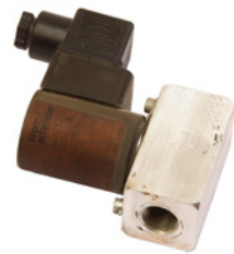
Krom Schroder Solenoid - Has a distinctive Aluminium Body. - Used on Thermoflows from 1998 - 2003 - Replaced by Brahma Solenoid & Valve