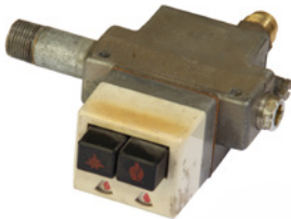
Simplosit - Used on Thermoflows, Visions, Inserts, Baskets from 1982 - 2007 - Replaced by Negabahn (BM Copy) and 3 Way Pilot Valve