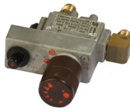
Catoba CTB - Used on 'G' series and Masport Products from 1995 - 1996 - Replaced by 'G' series conversion kit including Negabahn Valve (BMCopy)