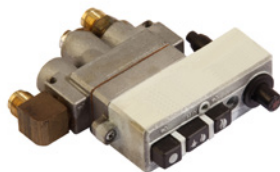
Catoba P90 - Used on Thermoflows, Inserts, Baskets, some Visions, and Free Standing 'G' series Fires from 1993 - 1996 - Replaced by Negabahn (BM Copy)