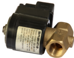
Brahma 3/8 Solenoid & Valve - Used on Thermoflows, Baskets, Inserts, some 'G' series and Masport Products, some Visions from 1990 - 2012 - Still available