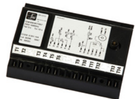
SIT EFD Control (Black Pack) - Used on Thermoflows, DVs, Visions, Eastsides, Baskets, and Inserts from 1994 - 1998, and 2003 - 2011 - Replaced by Brahma Pack