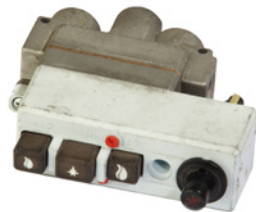
Catoba P88 - Used on Thermoflows, Inserts, Baskets, and some Visions from 1987 - 1993 - Replaced by Negabahn (BM Copy)