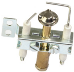
3 Way Pilot for Electronic Fire - LPG or Natural Gas - Used on Living Flame Products from 1992 to Present Day - Still available

Over the years, we have made many fireplaces with many controls. If yours is older, parts may be obsolete. Where we can we have replaced them with better parts. The following is a list of obsolete parts. If you have a part, let us know what it is and we will find you something new.