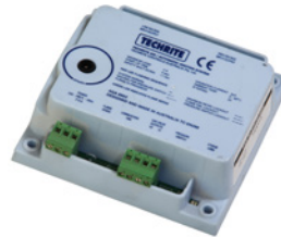
TAIS 00R15 (Techrite Pack) - Used on Thermoflows, Visions, Manhattans, DVs, Inserts, and Baskets from 2010 - 2014 - Replaced by Brahma Pack with New Leads